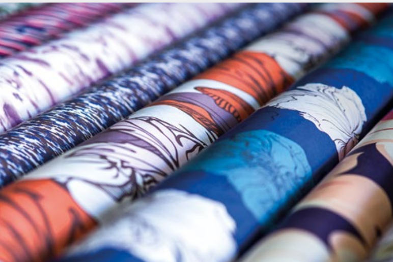
Photo printing quality and delivery speed are the added values of a product that, thanks to water-free printing, is completely eco-sustainable.

Simple and environmentally sustainable to apply thanks to the hot pressure process, Transfer Paper allows you to ennoble any polyester fabric with the wide range of designs proposed, enriched by the continuous creations of the designers made to the specific needs of customers.